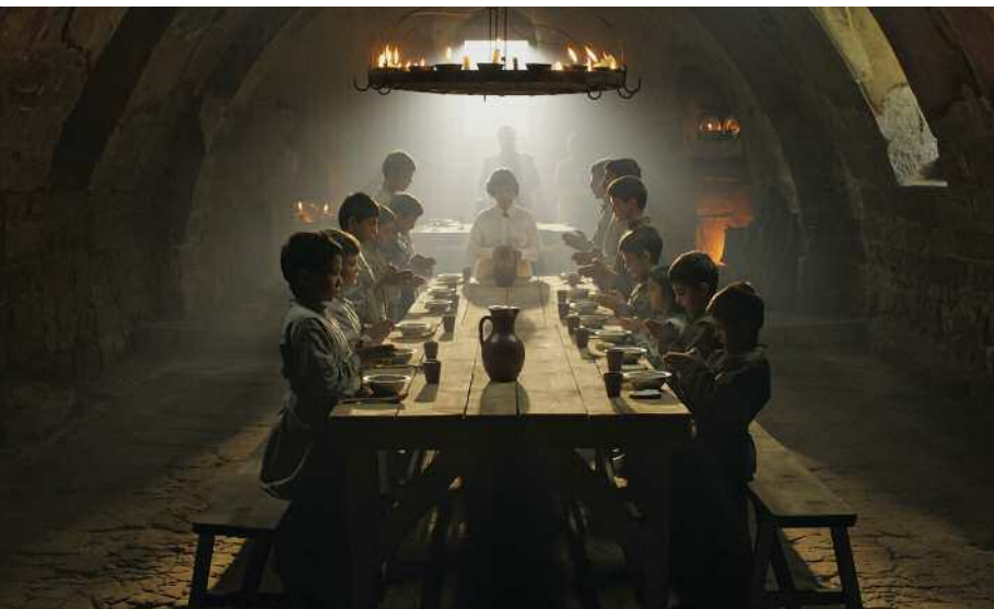
Top: Maryam finds shelter in an orphanage. Bottom: Practical candlelight and the stone-oven fire provided a base layer of smoke that the filmmakers supplemented with a smoke machine for this orphanage interior.