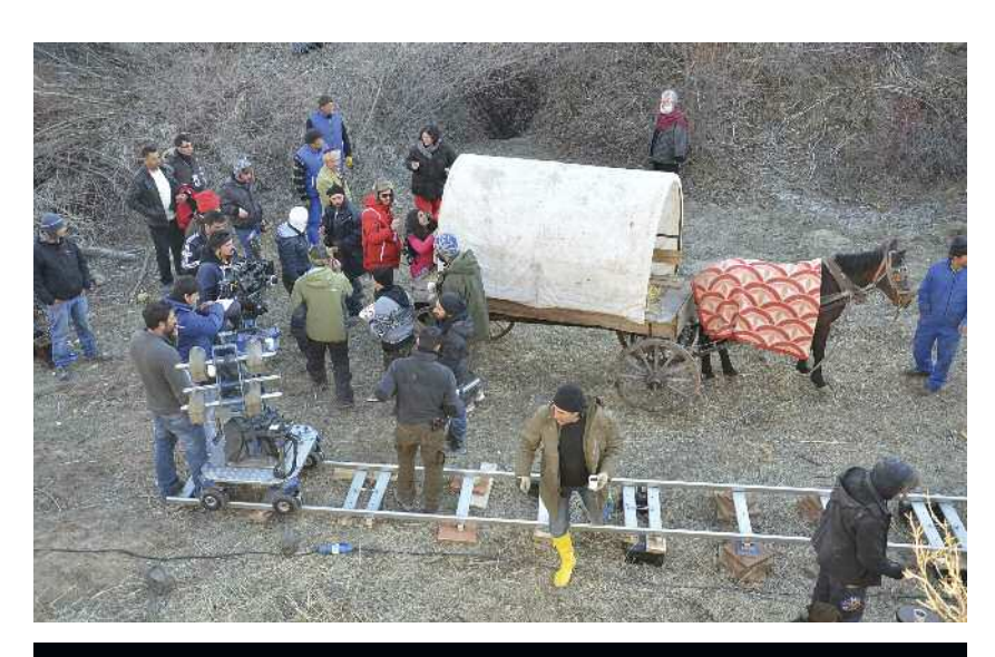
The crew prepares its MovieTech Magnum dolly for a tracking shot alongside the smugglers' covered wagon.

"But," Alyamac adds, "we said, 'We only have one chance to make this film.' And thank God we went, because we found an angle we hadn't seen any of the times we'd gone before.