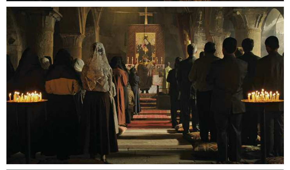
Top: The children lead their mother (Takuhi Bahar) into their grandfather's workshop. Middle: The siblings' grandfather (Sarkis Acemoglu) works by candlelight. Bottom: Perdeci had 12K Dinos placed outside this church's windows to bolster the daylight ambience and contrast with the warm candlelight.

After that, all the actors felt it was now possible to make the movie."